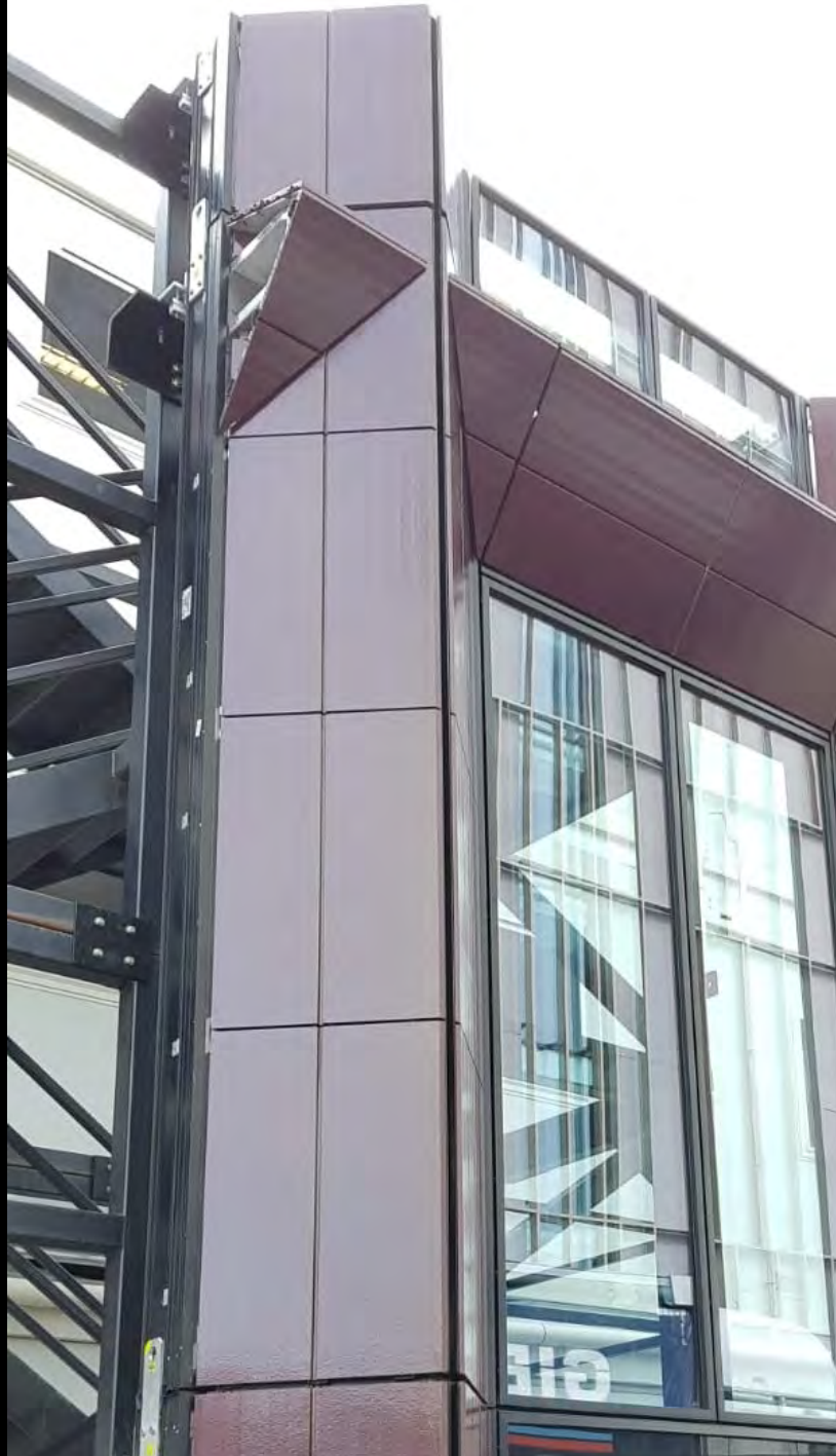
Visual Mock-up on site